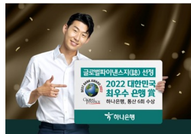
Son Heung-Min, Forward, Tottenham Hotspur