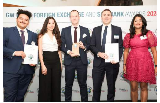
Investec's team receiving the 2024 World's Best FX Trading Platform and Best Foreign Exchange Bank in Ireland awards